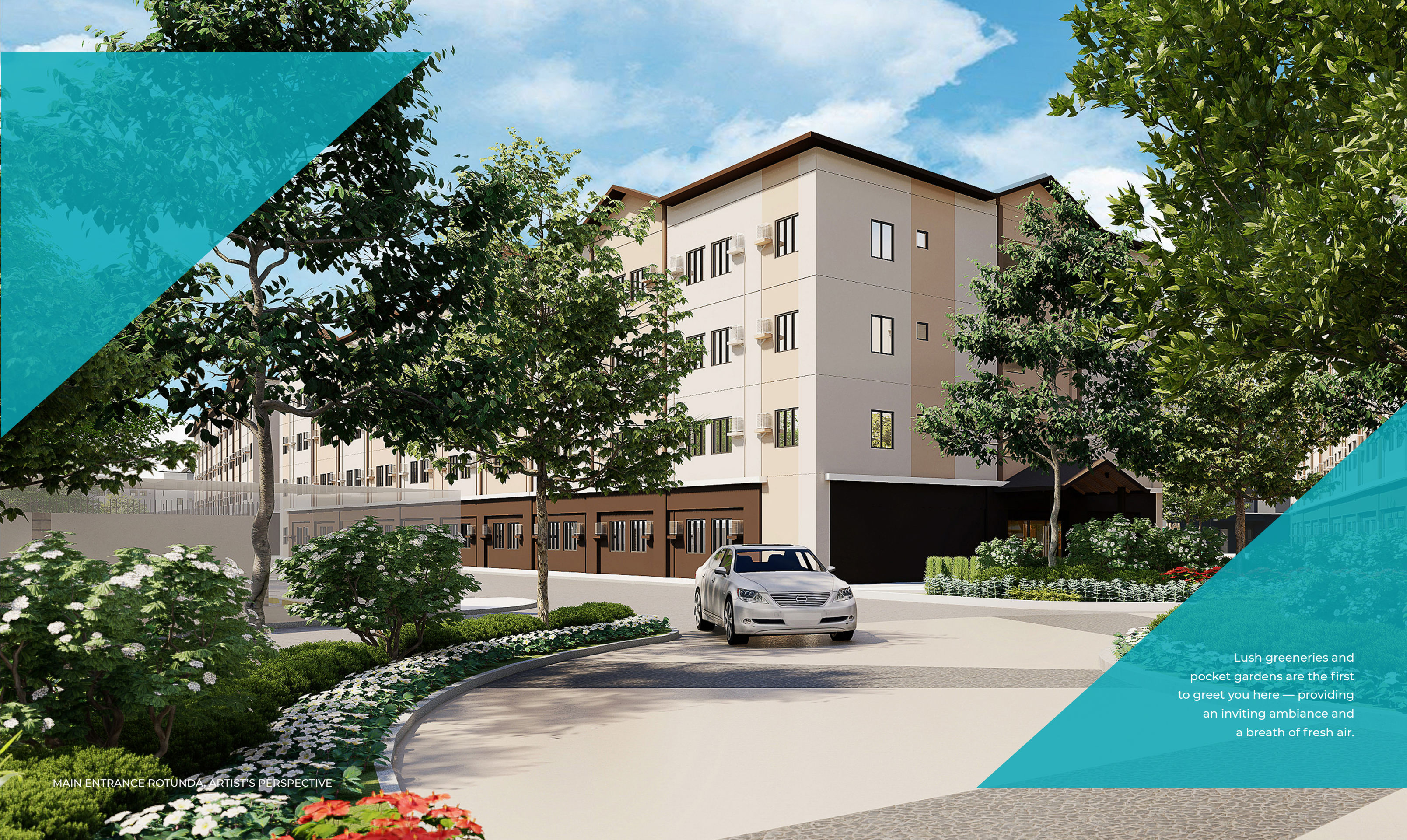
MAIN ENTRANCE ROTUNDA, ARTIST'S PERSPECTIVE

Lush greeneries and pocket gardens are the first to greet you here — providing an inviting ambiance and a breath of fresh air.